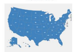
Interactive Map of Local, State, Regional and National Dairy Food Safety Resources