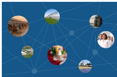
2021 Materiality Assessment for U.S. Dairy ©2021 INNOVATION CENTER FOR U.S. DAIRY