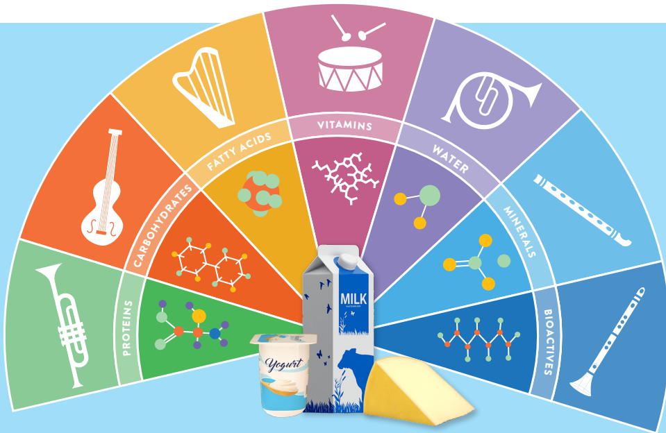
For illustration only, not true to structure.

The foods we eat are more than just nutrients 1 —their entire package impacts our health. It's not only what's in our favorite foods, but how nutrients and non-nutrient components work together and the form they take (liquid, gel, solid). Nutrient-rich dairy foods like milk , cheese and yogurt at all fat levels, as part of healthy eating patterns, provide essential nutrients and key components that can help support our health. 2 That's the power of the dairy food matrix.