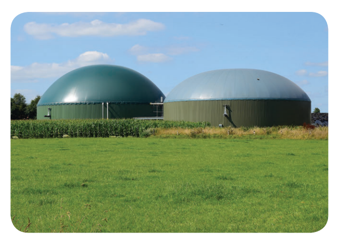
The dairy community recognizes the need to do more with less and minimize waste.

<u>www.commitment.usdairy.com</u> and reading the 2018 U.S. Dairy Sustainability Report.