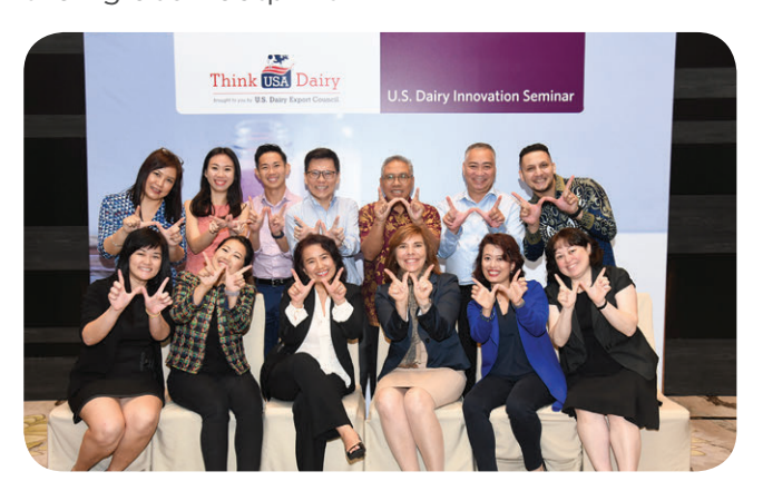
USDEC staff and international guests attend the U.S. Dairy Innovation Seminar in Singapore.

The checkoff also support U.S. dairy exports by expanding successful domestic foodservice and dairy company partnerships that grow sales within the United States to reach people beyond our borders. In 2018, we expanded our Yum! ® partnerships by working with Pizza Hut® in Asia Pacific and KFC® in the Caribbean and Latin America to introduce the high-quality, greattasting and versatile benefits of U.S. dairy to international customers. This approach allows us to build on the equity of our partners and their global footprint.